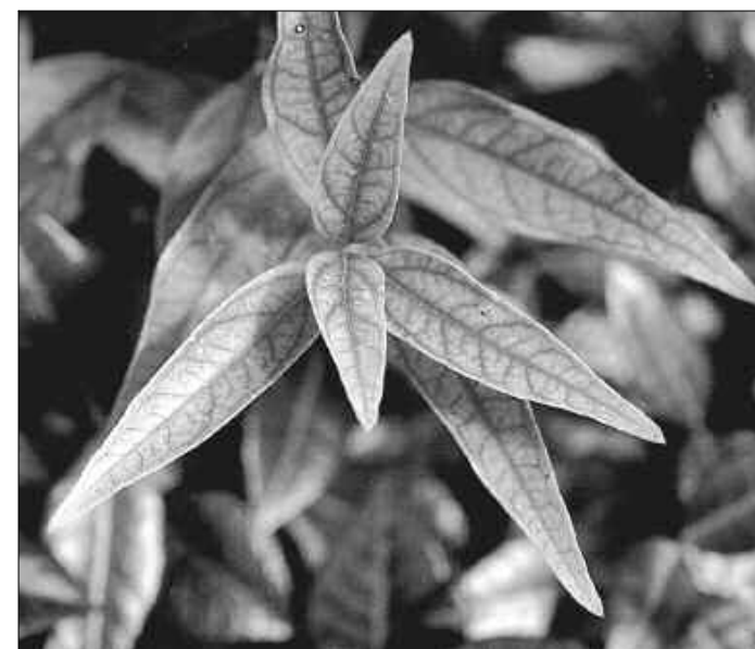
If eaten, Carolina jessamine is poisonous to people.

Whatever is leaching from the concrete will be highly alkaline and chemically imbalanced for growing plants. To solve the problem until the leaching stops, add lots of compost, coffee grounds and other organic amendments to the soil. (See Resources to learn